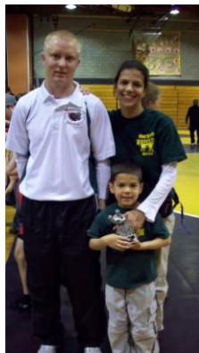
Wrestling A Family Affair

The State of California Wrestling Association for the Youth (SCWAY) is the new guy on the block. Strength is the national organization that supports the idea, NUWAY, and its focus on Folk Style only. Weakness it's new in a conservative wrestling state that takes change hard. Time will tell if they offer a viable service to California Youth Wrestling.